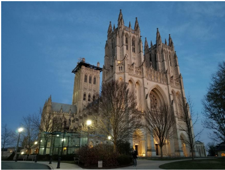
THE WASHINGTON CATHEDRAL (DID YOU KNOW IT WAS EPISCOPALIAN?)